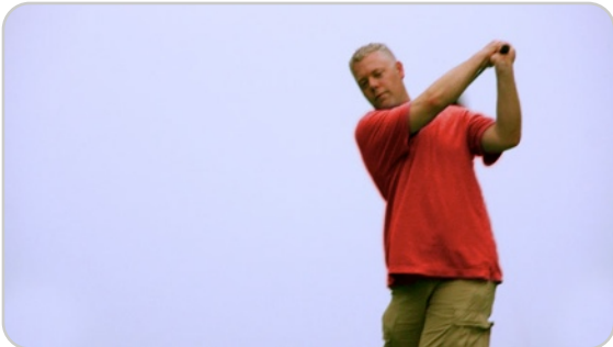
Shot 9 (edit option): ...swing. Enabler is clearly not there.