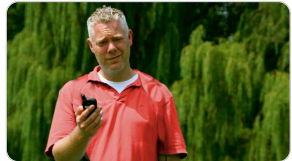
Shot 16: GOLFER'S FACE BUILDS WITH CONFIDENCE.