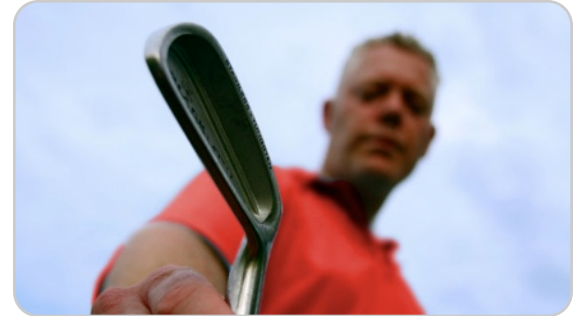
Shot 8: Golfer confidently pulls cover off of 3 wood