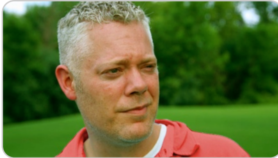
Shot 7: A confidence light bulb goes off in the Golfer's head and....