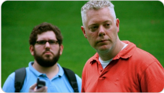
Shot 11: Reveal Enabler

ENABLER: "There's a creek at 137. You should fly the ball 155 to the right side."