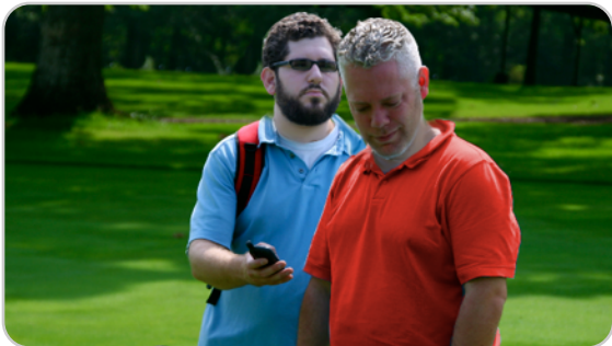
Shot 14: Golfer contemplating which club to use.