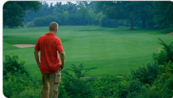
Shot 4: We see Golfer alone and the fairway over his shoulder.