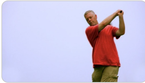
Shot 18 (edit option): Quick cut to tail end of swing. Enabler is clearly not there. SFX: ball crack noise