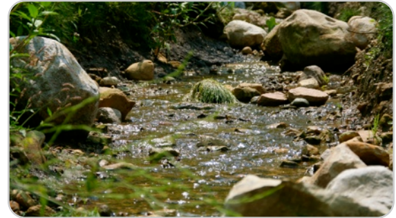
Shot 13 (edit option): Creek cutaway