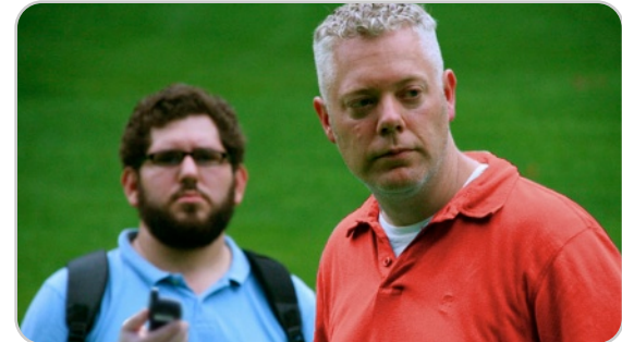
Shot 5: Enabler cont.

ENABLER: ...And 262 to carry the left bunker.