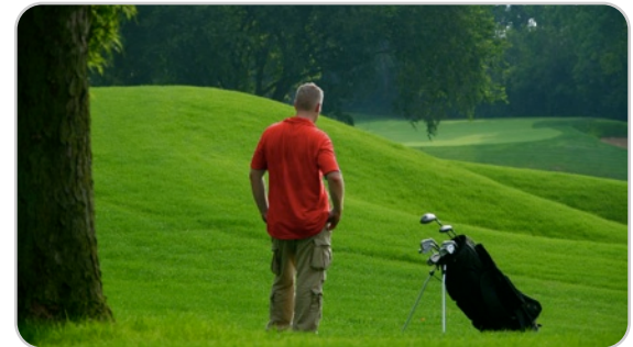
Shot 10: Open to find the Golfer off the fairway with an obstructed view of the green.