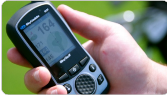
Shot 12: Device cutaway

ENABLER: "There's a creek at 137. You should fly the ball 155 to the right side."