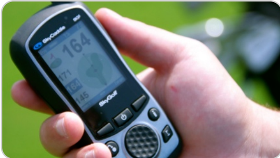
Shot 3: Device cutaway