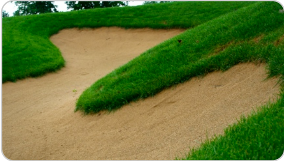
Shot 6 (edit option): Nasty fairway bunker cutaway.