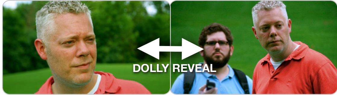
Shot 2: Close up on the Golfer as he clearly questions his shot. Dolly to reveal Caddie.

Music: Sparse and simple cinematic underscore.